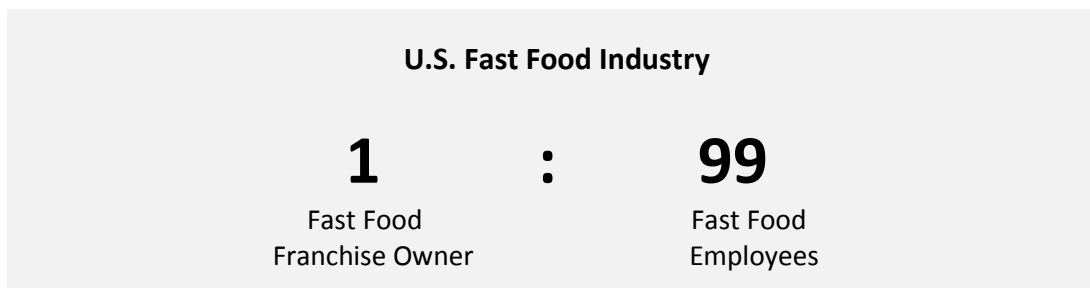
Fig. 3: Fast Food Franchise Owners Make Up a Tiny Share of Total Fast Food Employment