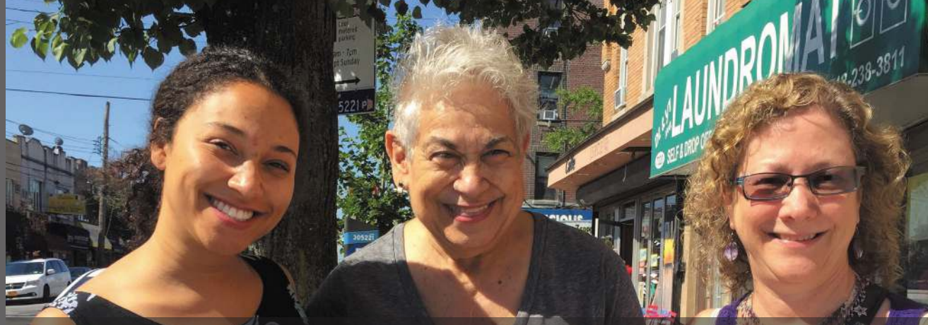
NY Caring Majority is a movement of seniors people with disabilities, family caregivers, domestic workers, and home care providers from all across New York state.

Learn more about all NELP partners at nelp.org.