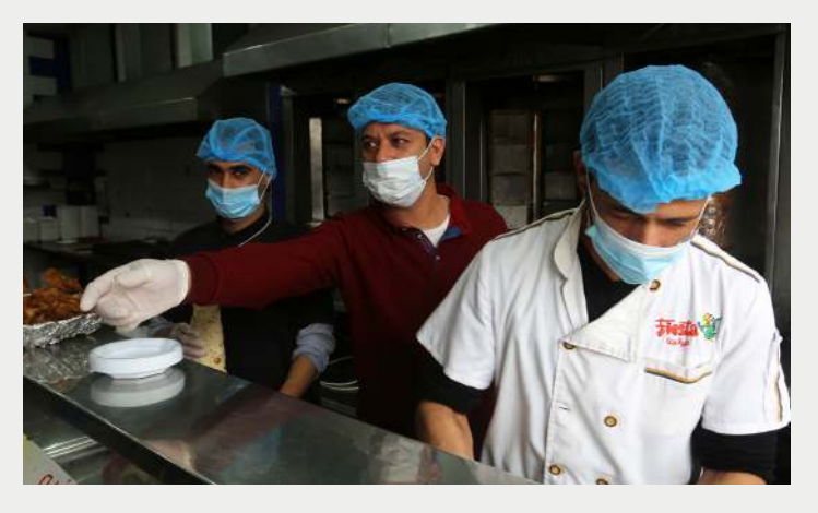
PREMIUM PAY FOR FRONTLINE WORKERS

Companies should provide reasonable accommodations beyond what is required by law to support workers <u>at higher risk</u> and pregnant workers.