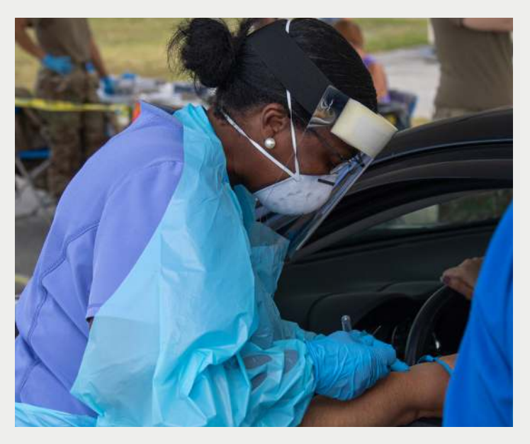
The National Guard, bit.ly/36cSJEA

1. A worker experiencing symptoms of, seeking testing or treatment for, or recovering from COVID-19;