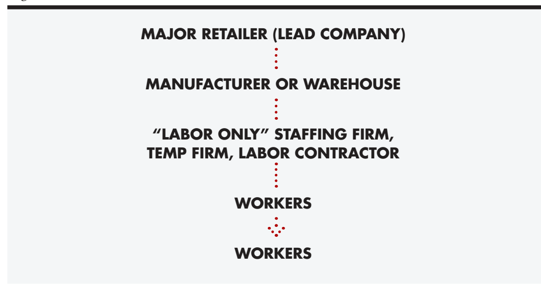
Figure 3: Retail Supply Chain Subcontracting

Under a typical model of outsourced labor in the industry, a lead company contracts with a janitorial company to provide maintenance services at the lead company's facilities. The first tier janitorial company does not directly provide cleaning services, and instead hires second-tier subcontractors to provide cleaning services at a lower price. The second-tier subcontractors provide the janitors to clean facilities. Second-tier subcontractors are often able to make a marginal profit only by engaging in cost-saving strategies, including misclassifying janitors as independent contractors or selling "franchise" licenses to unwitting workers. Second-tier contractors save costs by evading payroll taxes, workers' compensation, and minimum wage and overtime requirements at the cost of the janitorial workers.<sup>6</sup> Industry analysts note that "nonemployers"-those classified as independent contractors and franchises-account for 93 percent of all janitorial service companies.