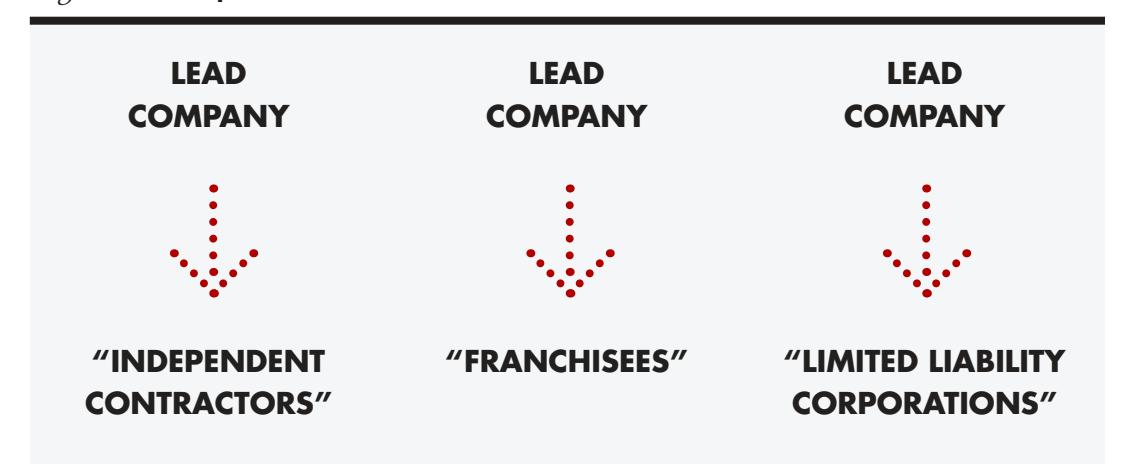
Figure 1: Independent Contractors, Franchisees and LLC's

Another widely-recognizable form of outsourcing is one in which an employer inserts an intermediary between itself and the workers and designates the intermediary as the workers' sole "employer." These intermediaries may be "labor only" temporary or staffing