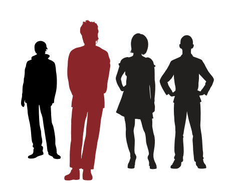
Sixty-five million U.S. adults, over one in four adults, have a criminal record.

Not only is it a matter of public safety to ensure that all workers have job opportunities, but it is also critical for the struggling economy. No healthy economy can sustain such a large and growing population of unemployable workers, especially in those communities already hard hit by joblessness. Indeed, the impact on the economy is staggering. The cost of corrections at each level of government has increased 660 percent from 1982 to 2006, consuming $68 billion a year,<sup>7</sup> and the reduced output of goods and services of people with felonies and prison records is estimated at between $57 and $65 billion in losses.<sup>8</sup>