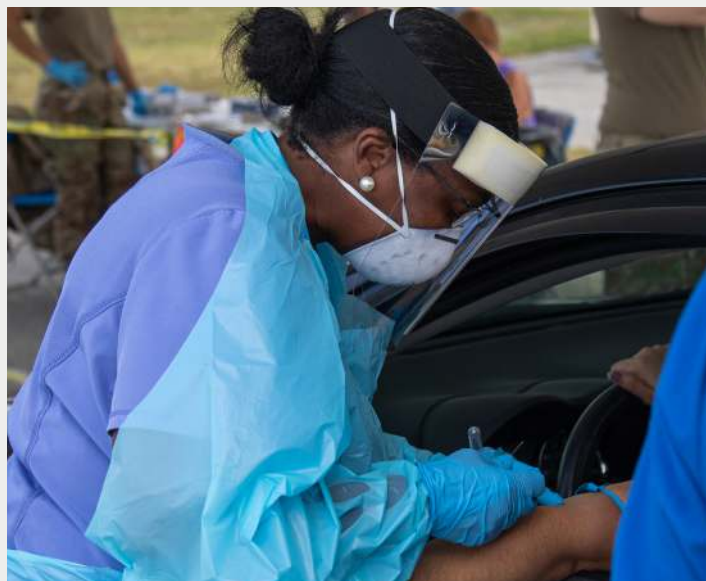
The National Guard, bit.ly/36cSJEa