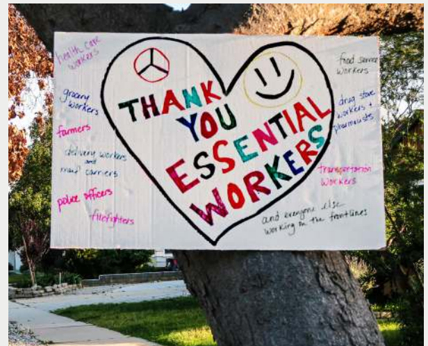
Russ Allison Loar, bit.ly/3dUYo51

Instead of laying off a portion of the workforce to cut costs, an employer may reduce the hours and wages of all workers or a particular group of workers. Workers with reduced hours and wages are eligible for pro-rated unemployment benefits to supplement their paycheck. Because work sharing is voluntary, employers can make decisions about participation in the program based on their unique circumstances. Employers should explore a formal work-sharing plan in the states that allow for it before resorting to layoffs. Notably, the CARES Act extended reimbursements and funding for state work-sharing programs.